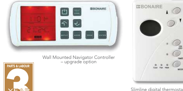
Slimline digital thermostat. Standard controller for the MB3.