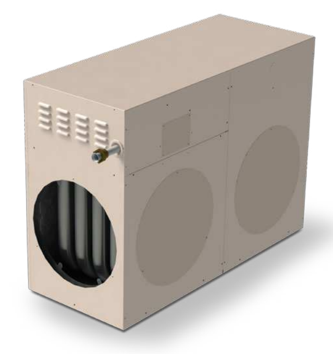
* Subject to zoning and duct requirements

MB4 is also compatible with Bonaire Dual Cycle refrigerated airconditioning.